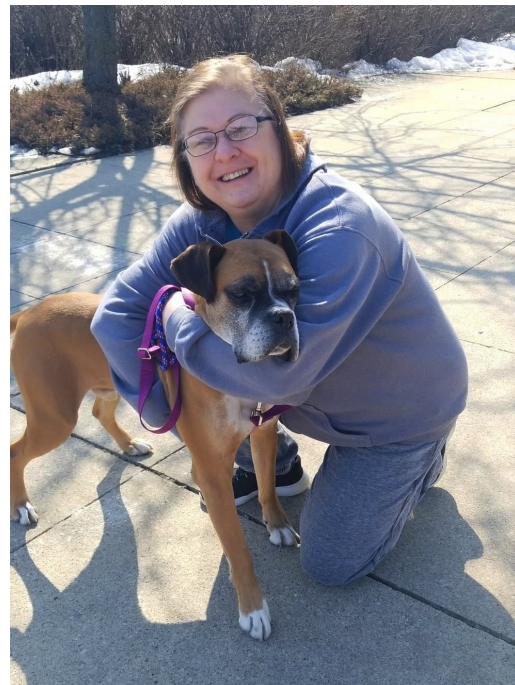
Billy Adopted 3/6/21

Our prayers were answered when we met this sweet Angel. She truly lives up to her name! We are so thankful to RCBR and all the volunteers that pulled Angel from her situation to give her a new life she so desperately deserved. We immediately learned that our sick frail girl can climb a fence! She likes to stand up on her hind legs to see what's on the counter. She is getting stronger every day. We are so in love with our sweet,