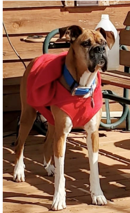
Gee Adopted 3/18/21

Thank you RCBR!!! You all helped make a great match!!