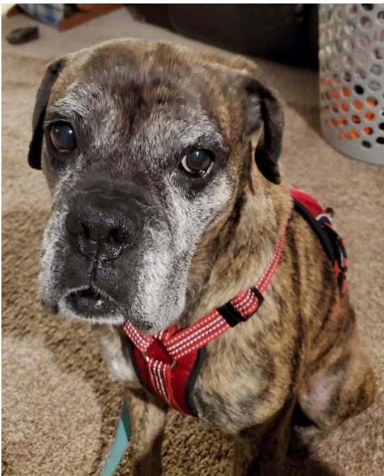
Angel Adopted 3/14/21

Our prayers were answered when we met this sweet Angel. She truly lives up to her name! We are so thankful to RCBR and all the volunteers that pulled Angel from her situation to give her a new life she so desperately deserved. We immediately learned that our sick frail girl can climb a fence! She likes to stand up on her hind legs to see what's on the counter. She is getting stronger every day. We are so in love with our sweet,