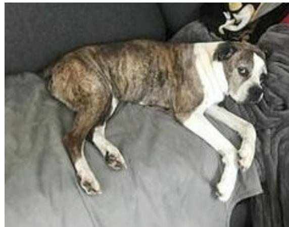
Gabby II Adopted 8/31/21

Ethyl is a very sweet snuggle bug! She has relaxed with her new sisters and now loves to play with them regularly. She loves all the people she meets!