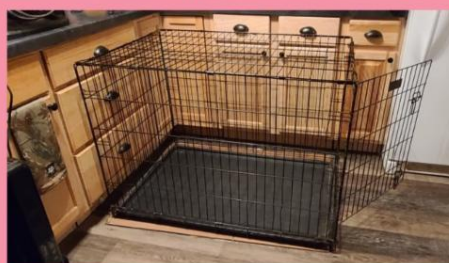
coming home to an empty kennel is the hardest... RIP Domino October 11, 2021