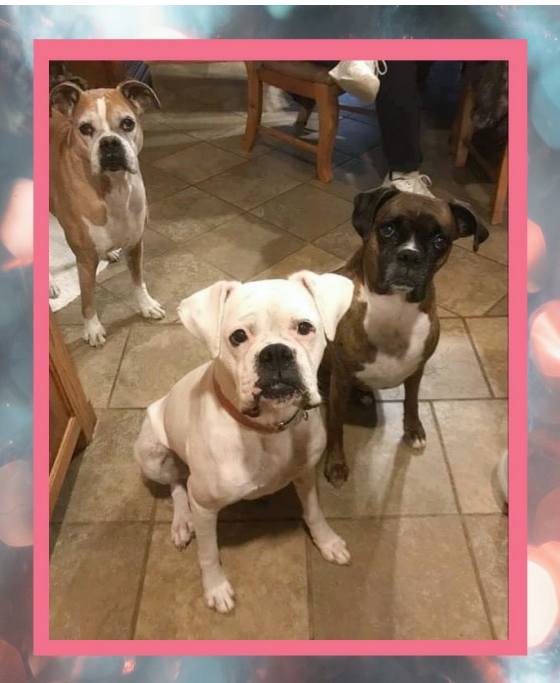
Ethyl Adopted 10/10/21

Ethyl is a very sweet snuggle bug! She has relaxed with her new sisters and now loves to play with them regularly. She loves all the people she meets!